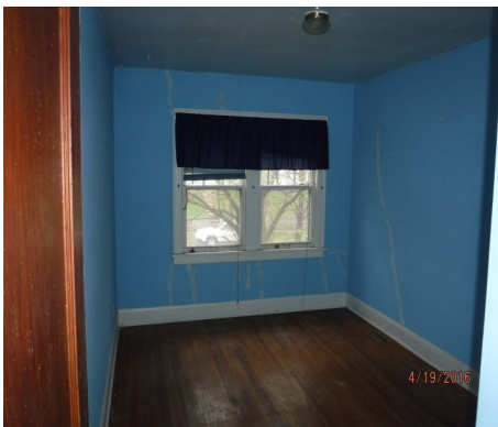
1ST FLOOR BEDROOM