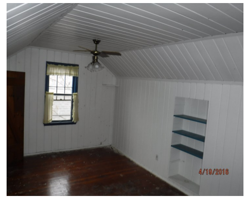
2ND FLOOR BEDROOM