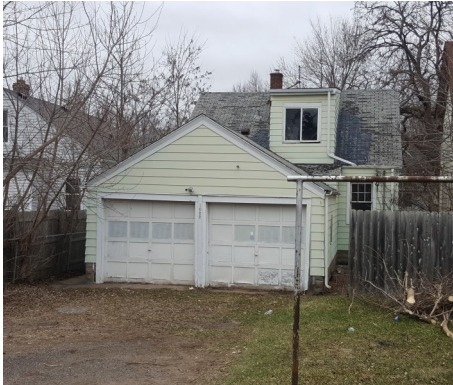
ATTACHED 2-CAR GARAGE