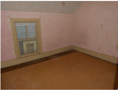
2nd FLOOR BEDROOM