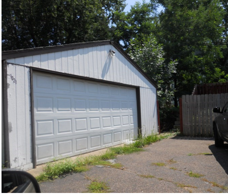
DETACHED 2-CAR GARAGE